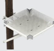
NEST PLATFORM WITH ATTACHMENT KIT RGNP-42-A