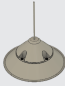
RAPTOR GUARD™ POLE TOP CAP RGPT-26