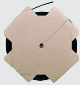
SUPER STRAP BANDING ROLL SSB-BA-3/4-98