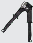
SUPER STRAP TOOL SSB-AT-3/4