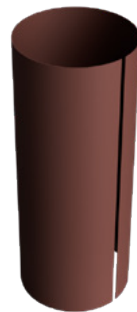
Brown pole wrap