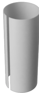
Gray pole wrap